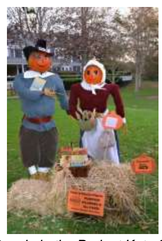
Photo from Pumpkin People in the Park at Kate Gould Park in Chatham ~ Friends of the Eldredge Library Display